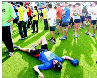
Ready to go: Runners prepare at the WACA for the start.