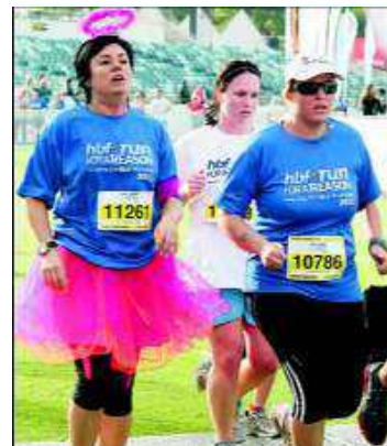
Fun: A runner gets in the spirit.