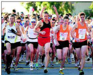
And they're off: The start of the Run for a Reason event.